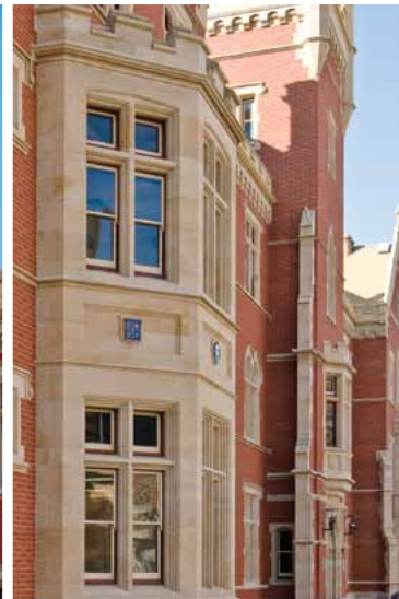
Brookman Building, University of SA; Fit Kidz Playspace, Dural, NSW