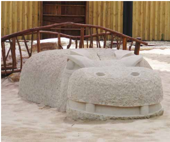
Fit Kidz Playspace, Dural, NSW