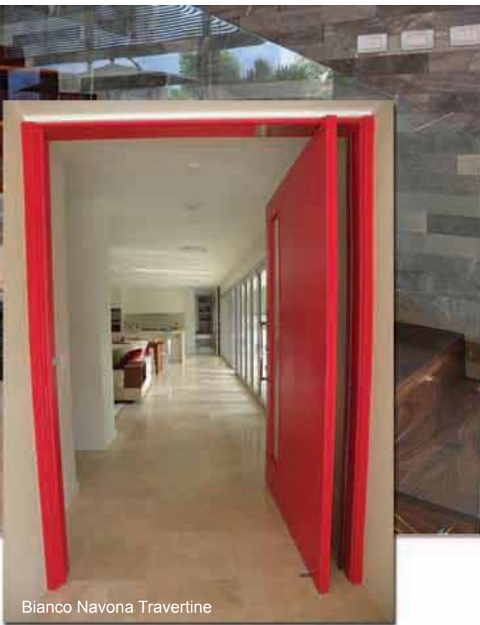
Bianco Navona Travertine