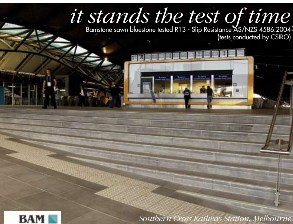
Southern Cross Railway Station, Melbourne

Bamstone sawn bluestone tested R13 - Slip Resistance AS/NZS 4586:2004 (tests conducted by CSIRO)