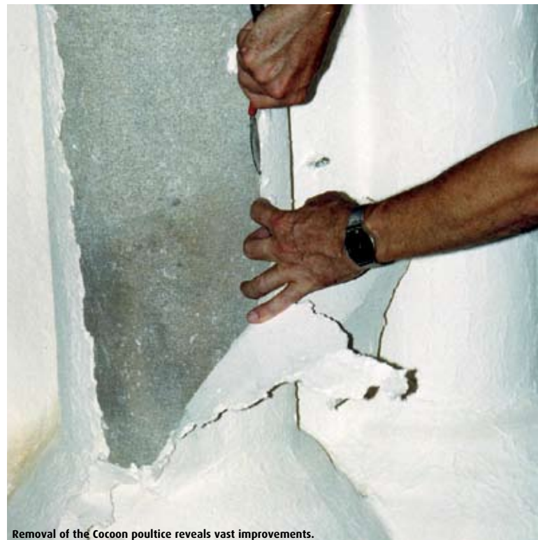
Removal of the Cocoon poultice reveals vast improvements.

Another tried and tested form of desalination includes poultices. Several products based on various clays or paper pulp have been tried in Europe and Australia with mixed results. Some products tend to dry very quickly, then shrink and crack losing contact with the wall in a short time – often well before the transfer of salt, activated by the water component, is complete.