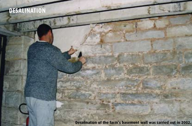
Desalination of the farm's basement wall was carried out in 2002.

Cocoon is a new generation desalination system that is having dramatic results. Developed by Sydney-based Australian company Westox, with salts analysis conducted by CSIRO, this paper poultice is manufactured from pharmaceutical-grade filter paper and is able to remove salts associated with both rising and lateral damp in a short space of time.