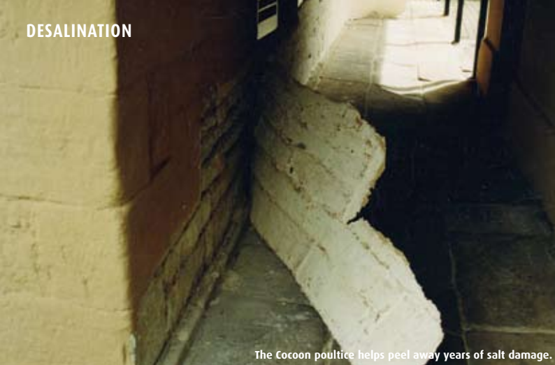
The Cocoon poultice helps peel away years of salt damage.

and by 87 per cent at the higher location. By this time, the Cocoon poultice was by weight, 24 per cent salt," revealed Barrie.